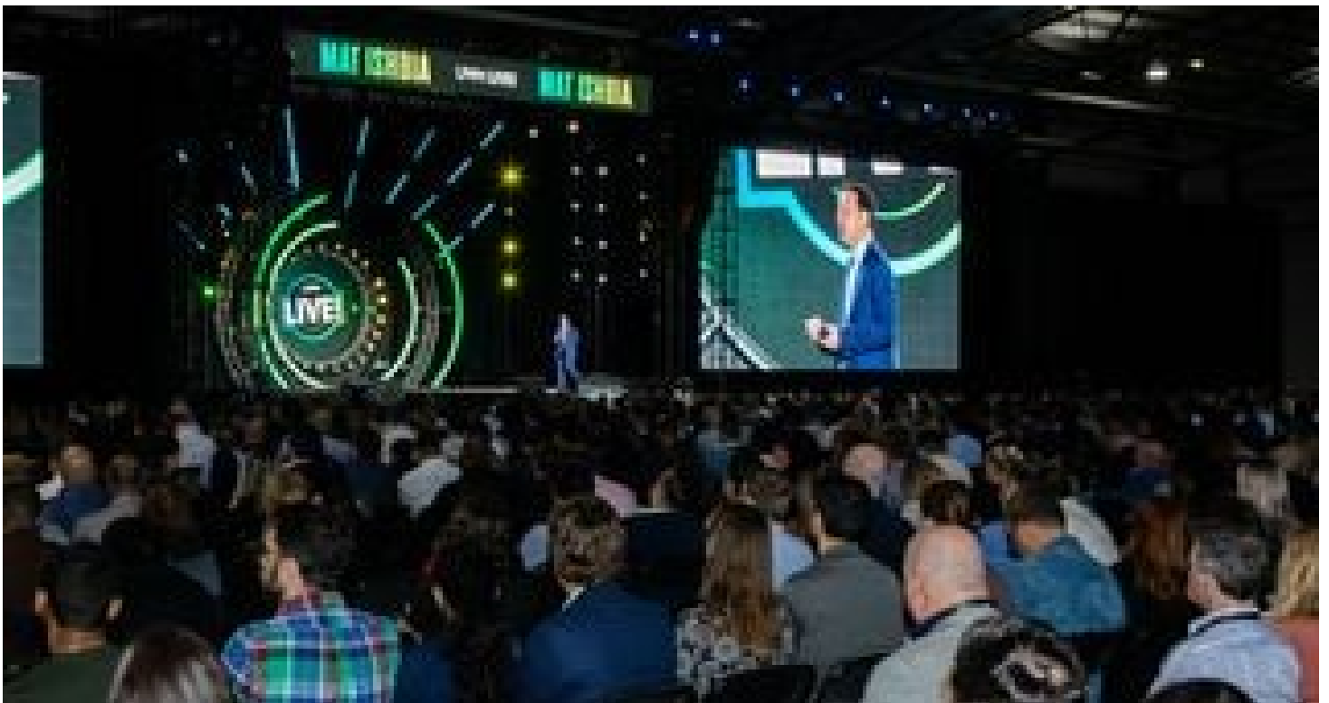
Metro Detroit's mortgage rivals take opposite paths on staffing strategy