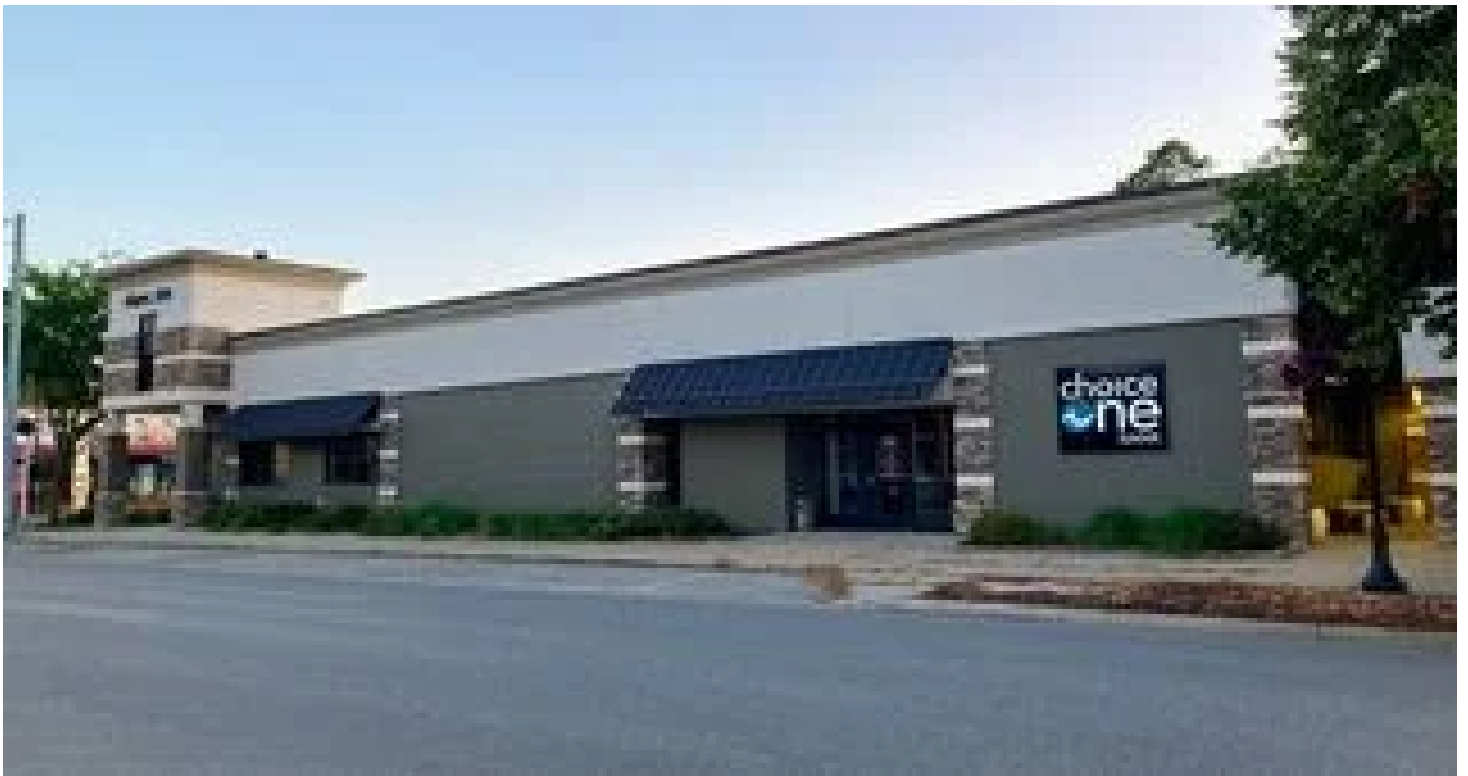
ChoiceOne Bank completes $180M acquisition, expanding Southeast Michigan presence